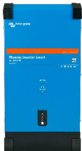
Inverter Smart 12/3000